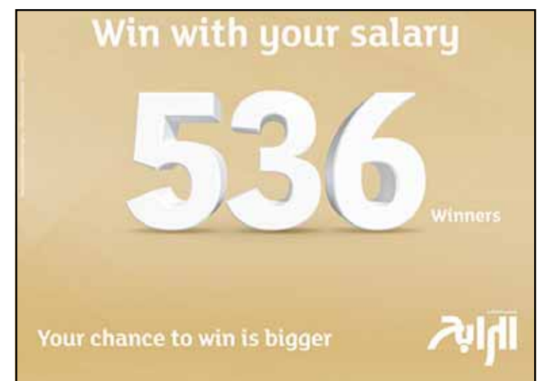
The campaign visual.

Regarding the terms and conditions of the prizes and draws, a customer is able to deposit 3 salaries during the 3 months prior to the draw, and the minimum balance of the account should not be less than KD 50 at the end of each month during the 3 months prior to the draw. Ten draws take place on a weekly basis for amount of K.D 1,500 for 10 winners each. 1 KG of KFH gold will be drawn monthly for one winner and K.D 25,000 for one winner every quarter, reaching a total number of 536 winners during the year.