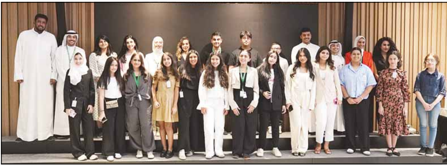
Photo of the workshop.

Interactive workshops foster skills in debate, teamwork and creativity