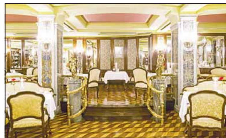
Riccardo Italian Restaurant.

Complementing the dining experience is Riccardo's timeless elegance. Its meticulously crafted décor, vibrant