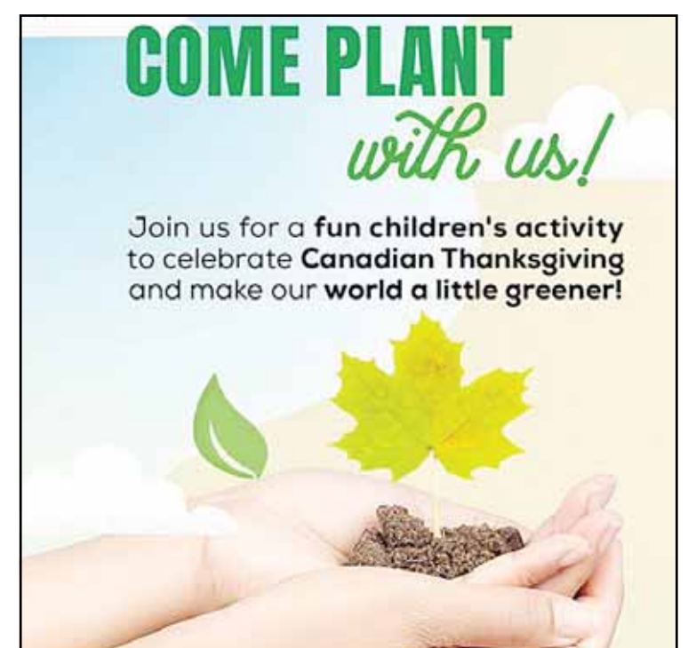
Poster of plant a tree event.

To enter on the day, children must bring clean plastic items for recycling.