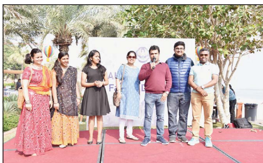
Photos from the event